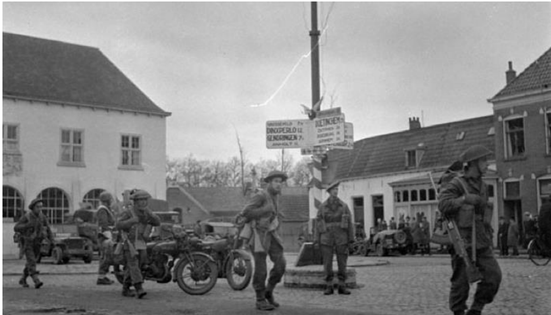
Infantrymen of Le Régiment de Maisonneuve moving through Terborg, Netherlands, 1 April 1945.

Kaartoverzicht The 3 rd Division