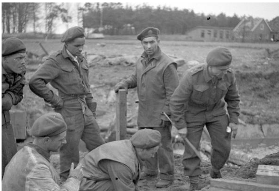
Personnel of the 7th Field Company, Royal Canadian Engineers (R.C.E.) , reconstructing the bridge joining Terborg and Doetinchem , 1 April 1945.

Regt task to protect left flank of 43rd Div and 8 Armd Bde (Brig Prior-Palmer), by patrolling to a depth of 7000 yards. The Royals were operating a further 3000 yards in front of us. 0530 H Hour It was hoped to flood the country with armour. Axis Road junction 088818-RUURLO 1188. Start delayed, but good progress made with fast movement. Small number of isolated enemy pockets were encountered, but not sufficiently strong to delay advance.