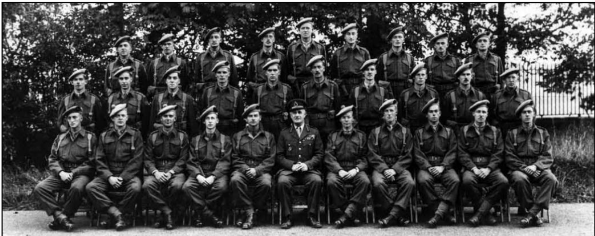
Officers of The First Battalion, The Black Watch (Royal Highland Regiment) of Canada, 24 September 1943

At 1530 hrs. we arrived at new location only to have another move on our hands and arrived at our new location just outside of Doetinchem from which the Germans had retreated only five or six hours previously. The CO and IO went on an “O” group at Bde around 2300 hrs. and got the plans for crossing of the Twente Canal – which was passed to Coy Commanders at midnight.